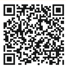
Scan the Qr Code to know your Schedule