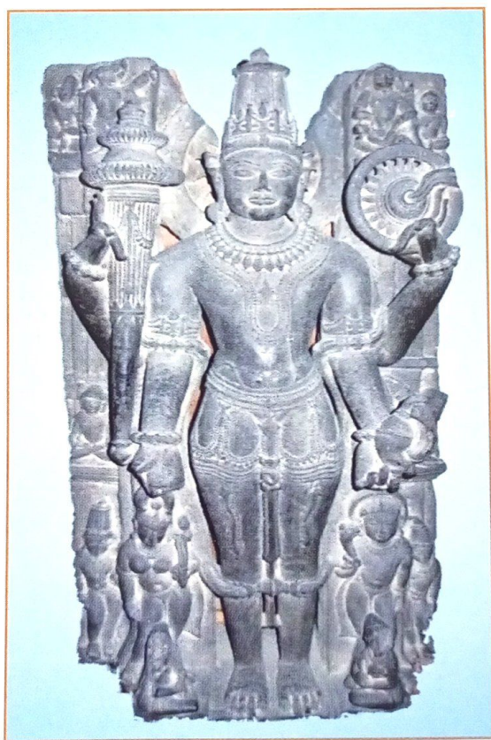
VISHNU Medieval Period

Pradesh is undoubtedly the seat of Buddhism. Which emerged as a religion and spread from here across the world. Main Buddhist places like viz. Sarnath, Sravasti, Kaushambi, Sankisa, Kapilvastu and Kushinagar etc.