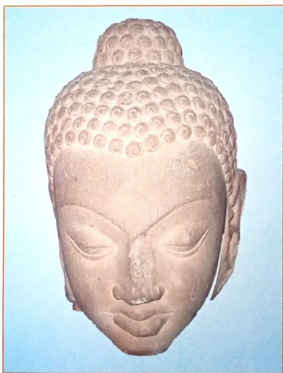
BUDDHA HEAD Gupta Period

The next gallery is 'Jain Gallery'. In this gallery inscribed Jain Ayagpatta, Tirthankar Rishabhath,